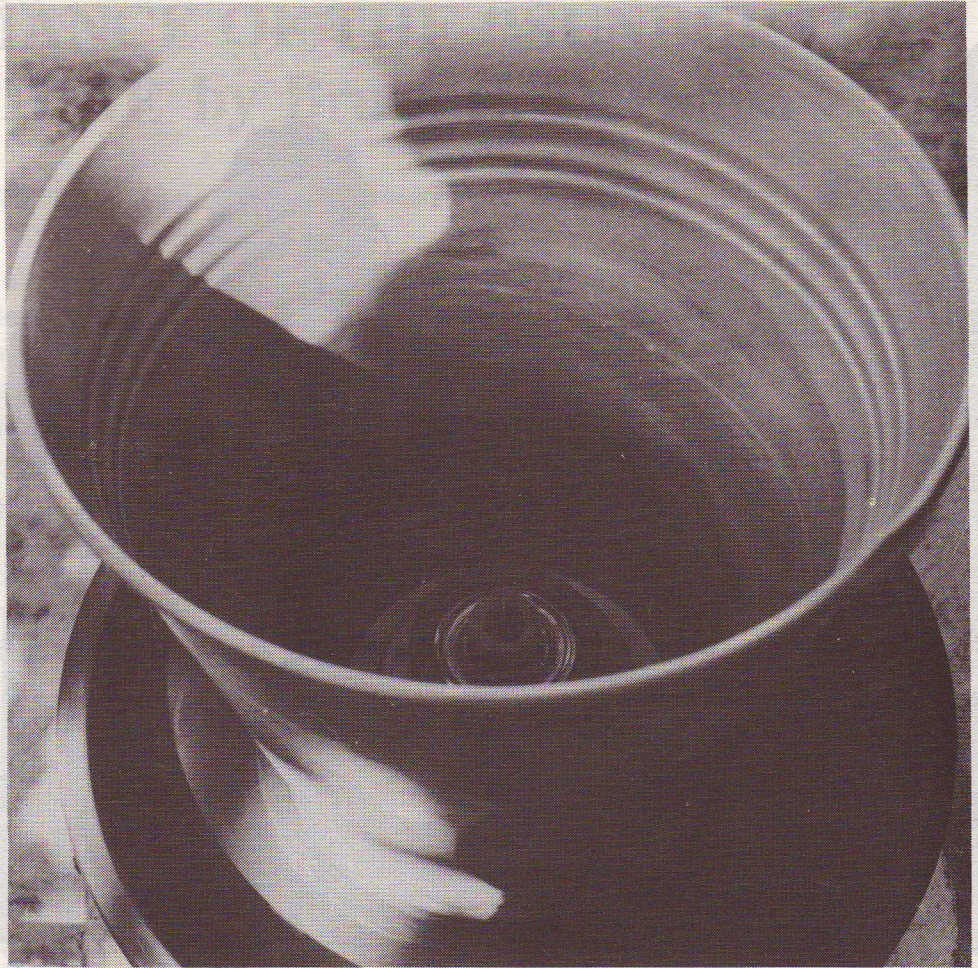
View showing the inside detail of the prototype of the Messiah Machine.

The air pressure acts as a stabilizer on the standing, turning and exchanging water wall.